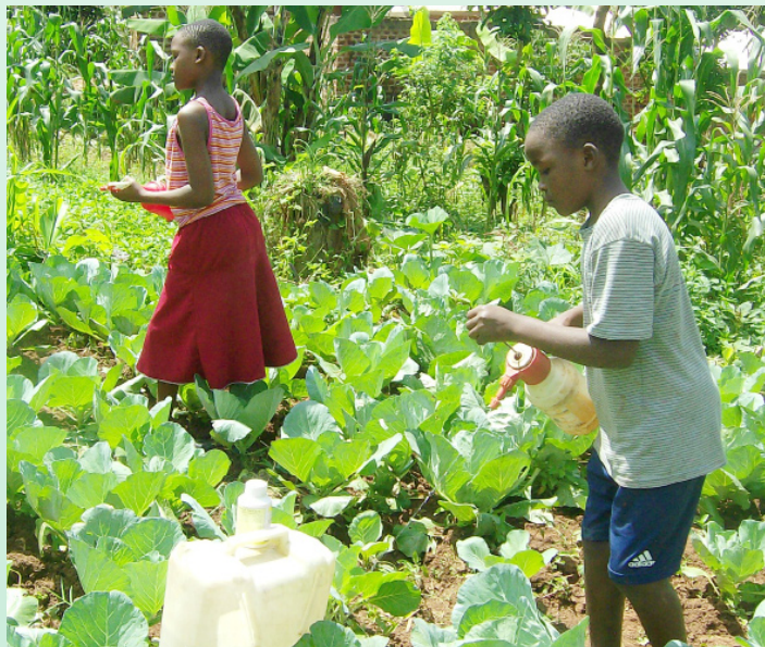
Stop hazardous child labour